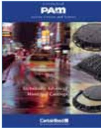
PAM General Brochure