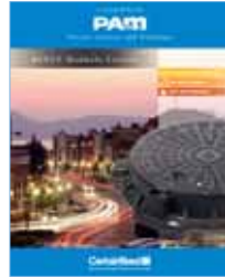
REXUS Manhole Covers