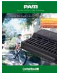
SELECTA Curb Units